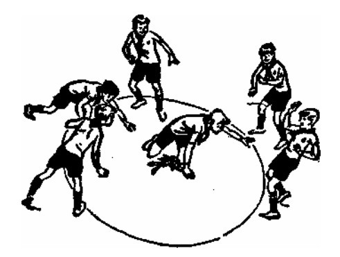
76. Dying Pigs

Players sitting in circle; at first signal each player inhales a deep breath, and at next signal lets it out with a long sustained whistle. As each player runs out of breath he lies down, dead. Last to die wins.